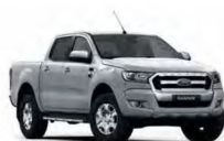
Moon dust Silver (Metallic*)