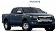
Sea Grey (Metallic*)