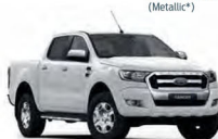
Frozen White (Solid)