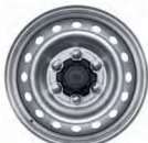
17" Steel wheels