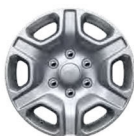
17" Alloy wheels Also available in black as an option on XLT derivatives.