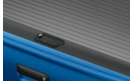
Mountain Top Industries® roller shutter

Lockable aluminium roller shutter helps protect your tools or your load. (Optional)