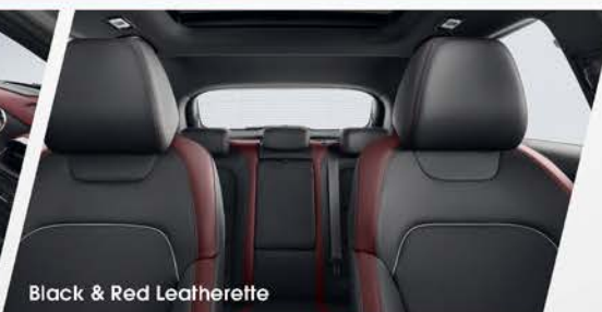
Black & Red Leatherette