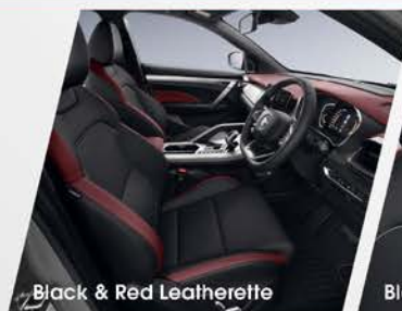
Black & Red Leatherette